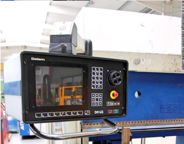
© A + B Werkzeuge Maschinen Handels GmbH