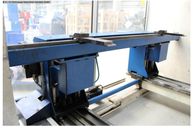
© A + B Werkzeuge Maschinen Handels GmbH