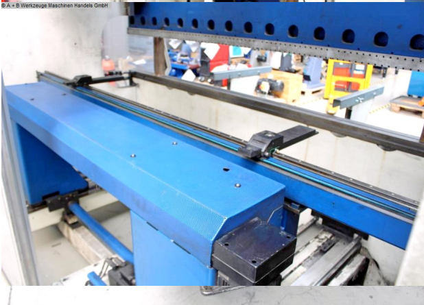
© A + B Werkzeuge Maschinen Handels GmbH