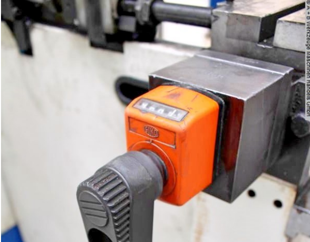
© A + B Werkzeuge Maschinen Handels GmbH

Schweißtechnik Lagereinrichtungen Industriebedarf Werkvertretungen Gebrauchsmaschinen