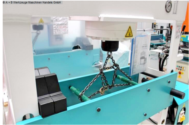
© A - B Werkzeuge Maschinen Handels GmbH