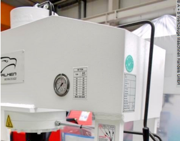
© A - B Werkzeuge Maschinen Handels GmbH

Schweißtechnik Lagereinrichtungen Industriebedarf Werkvertretungen Gebrauchtmachines