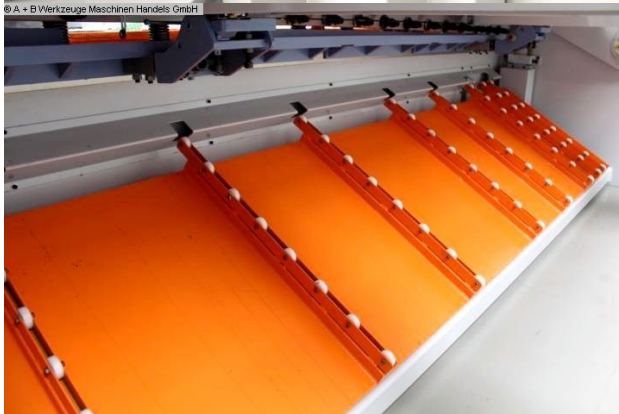
© A + B Werkzeuge Maschinen Handels GmbH