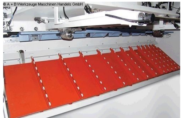
© A + B Werkzeuge Maschinen Handels GmbH