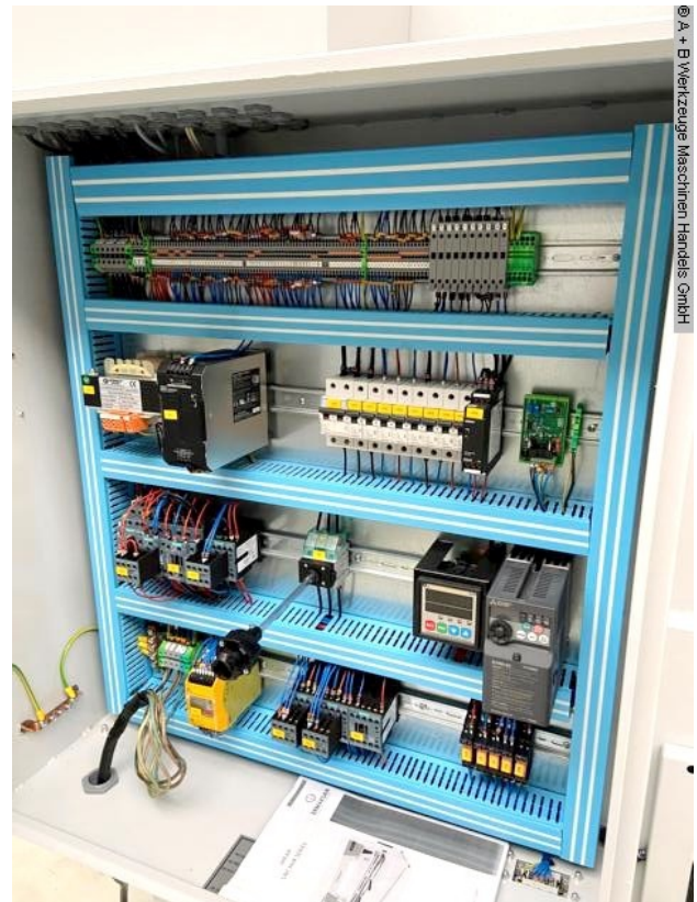
© A + B Werkzeuge Maschinen Handels GmbH