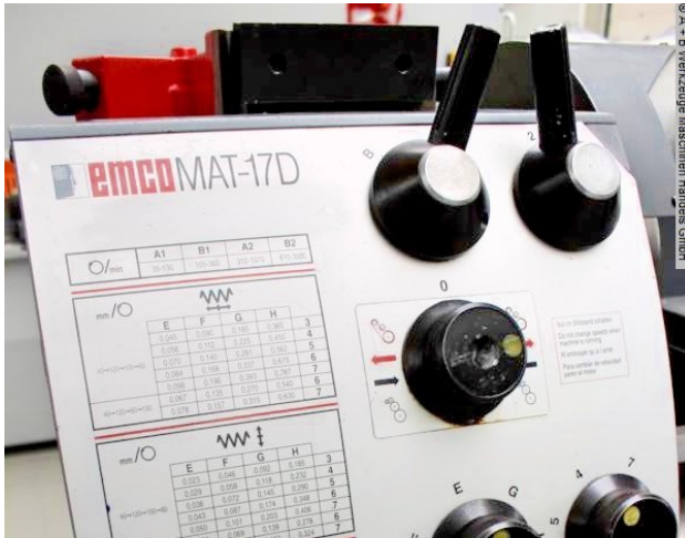
© A+B Werkzeuge Maschinen Handel GmbH

Schweißtechnik Lagereinrichtungen Industriebedarf Werksvertretungen Gebrauchtmachines