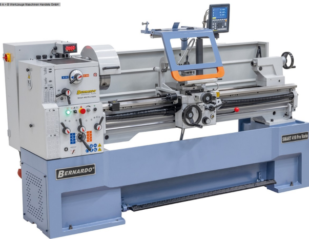
BERNARDO Maschinen - Austria