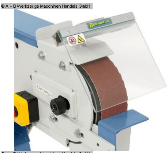
A + B Werkzeuge Maschinen Handels GmbH